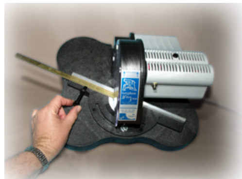
A simple clamp holds your work securely