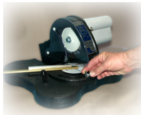
Miter table adjusts easily a full \pm 45^\circ