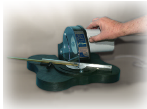
Chop saw design is fast and convenient

All mechanical components are guaranteed against failure for one year. If such a failure occurs for any reason other than abuse or misuse during this period, it will be repaired (or at our option replaced) free of charge FOB our factory. Blades will eventually wear or break, even in normal use. Their life cannot be guaranteed. Cosmetic damage is not covered under the warranty.